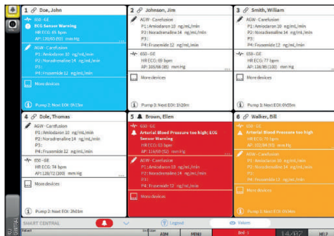
A sample screenshot of Digistat® Smart Central , showing 6 beds with patient vital signs from monitor, ventilator and infusion pumps including some alarms.

Please refer to the Intended Use and the User Manual, or contact Ascom UMS at it.info@ascom.com to get the complete specifications, features and limitations of the product.